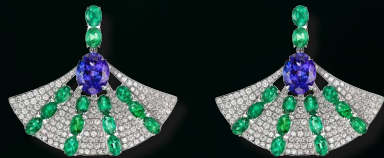
EARRINGS IN PLATINUM AND 18 K YELLOW GOLD WITH ROUND BRILLIANT DIAMONDS.