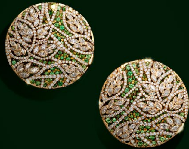
EARRINGS IN 18KYELLOW GOLD WITH ROUND TSAVORITES AND ROUND BRILLIANT DIAMONDS.