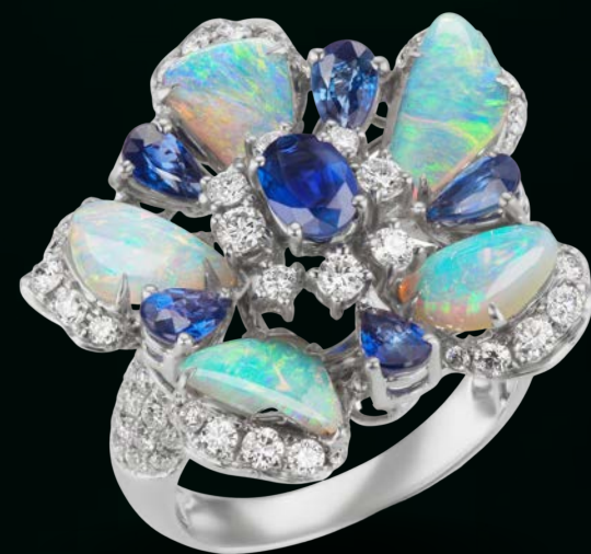
RING IN PLATINUM WITH AN EMERALD-CUT EMERALD OF OVER 10 CARATS AND ROUND BRILLIANT DIAMONDS.