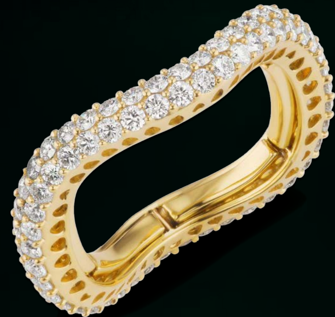
RING IN PLATINUM WITH AN UNENHANCED, ESTEEMED SRI LANKAN CABOCHON SAPPHIRE OF OVER 9 CARATS AND ROUND BRILLIANT DIAMONDS.