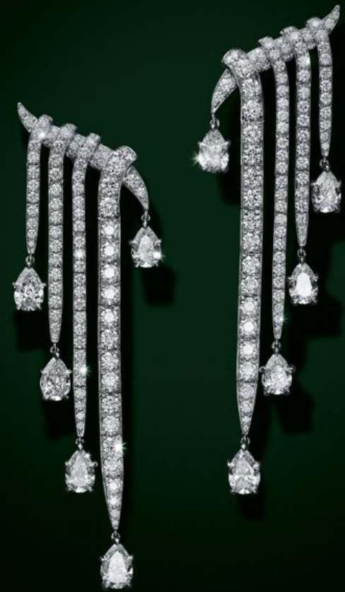
EARRINGS IN PLATINUM WITH PEAR-SHAPED AND ROUND BRILLIANT DIAMONDS.