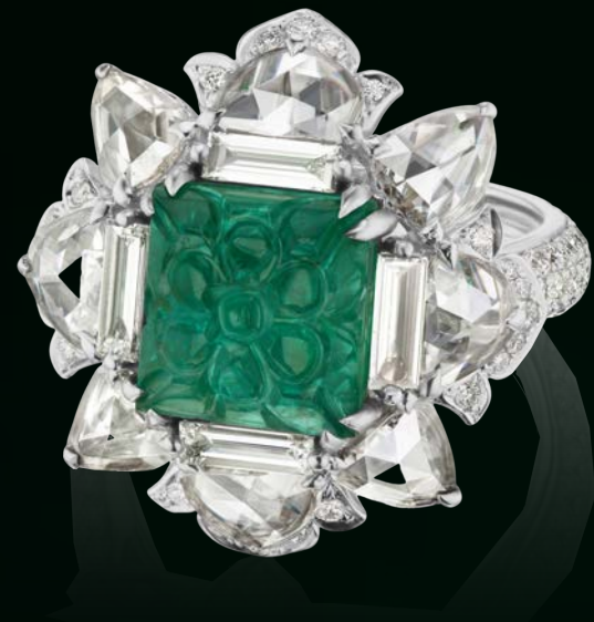
RING IN PLATINUM WITH ROUND PINK DIAMONDS AND ROUND BRILLIANT WHITE DIAMONDS.