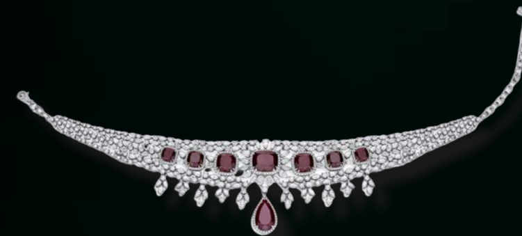
BROOCH IN PLATINUM WITH AN OVAL BLUE CUPRIAN ELBAITE TOURMALINE, TOURMALINES, FANCY, BLUE, PURPLE AND MONTANA SAPPHIRES WITH ROUND BRILLIANT DIAMONDS.