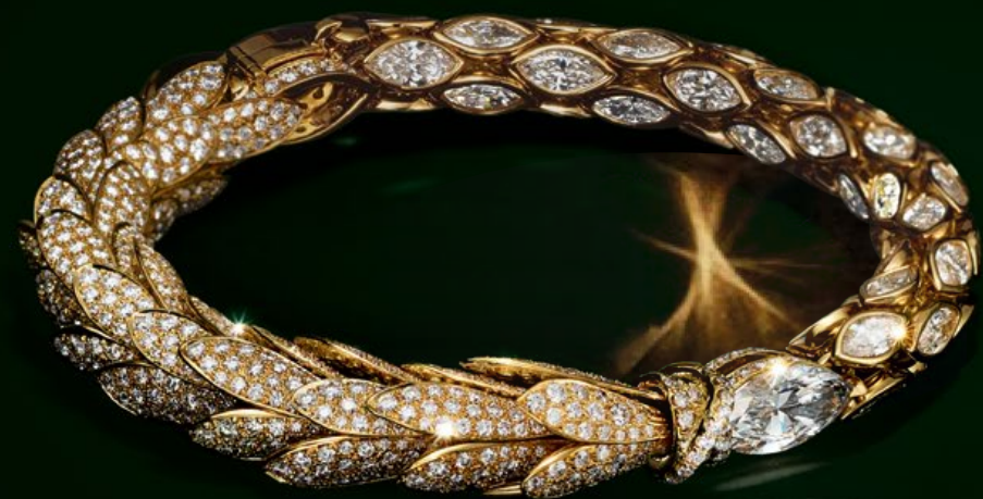
BRACELET IN 18K YELLOW GOLD WITH MARQUISE AND ROUND BRILLIANT DIAMONDS.