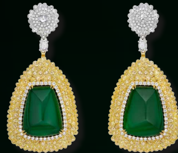
NECKLACE IN 18 KYELLOW GOLD WITH LENTIL-SHAPED SPESSARTITES AND RUBELLITES, ROUND BRILLIANT DIAMONDS AND COLORED GEMSTONES.