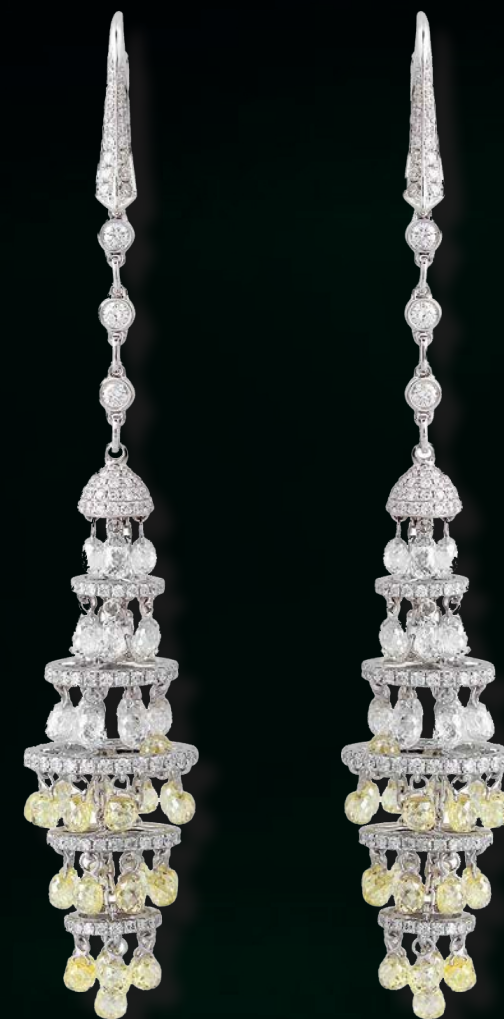
EARRINGS IN PLATINUM WITH OVAL TANZANITES OF OV E R 1 7 TOTAL CARATS, ROUND SAPPHIRES AND ROUND BRILLIANT DIAMONDS. EARRINGS IN 18KYELLOW GOLD WITH OVAL TANZANITES OF OV E R 1 1 TOTAL CARATS, TSAVORITES, SAPPHIRES AND MIXED-CUT DIAMONDS.