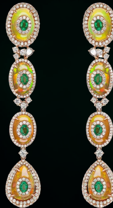
BRACELET IN PLATINUM AND 18K YELLOW GOLD WITH BAGUETTE AND ROUND BRILLIANT DIAMONDS.