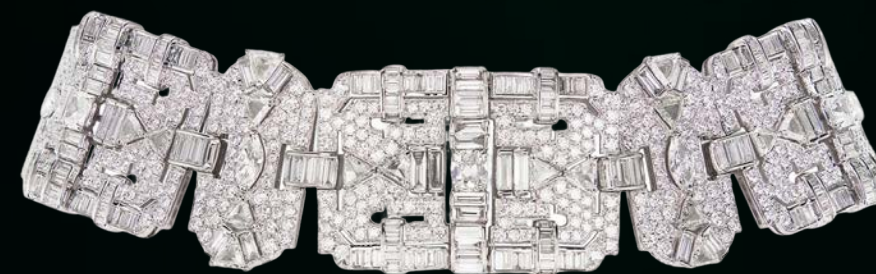
BROOCH IN PLATINUM WITH AN OVAL BLUE CUPRIAN ELBAITE TOURMALINE, TOURMALINES, FANCY, BLUE, PURPLE AND MONTANA SAPPHIRES WITH ROUND BRILLIANT DIAMONDS.