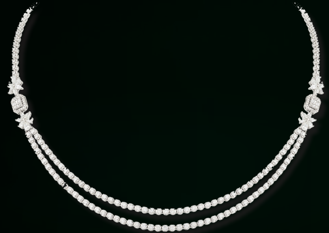
NECKLACE IN PLATINUM WITH EMERALD-CUT, PEAR-SHAPED AND ROUND BRILLIANT DIAMONDS OF OVER 100 CARATS.