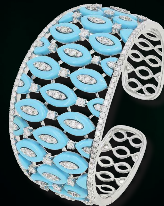
RING IN PLATINUM AND 18K YELLOW GOLD WITH A RECTANGULAR MODIFIED BRILLIANT FANCY VIVID YELLOW DIAMOND OF OVER 2.6 CARATS AND ROUND BRILLIANT WHITE DIAMONDS.