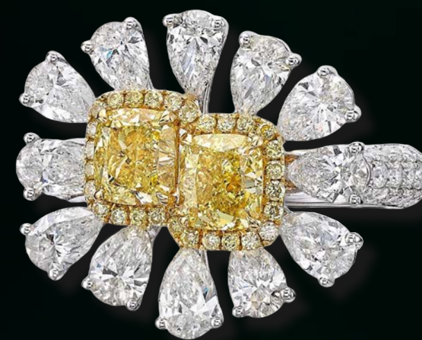
BROOCH IN PLATINUM WITH AN OVAL BLUE CUPRIAN ELBAITE TOURMALINE, TOURMALINES, FANCY, BLUE, PURPLE AND MONTANA SAPPHIRES WITH ROUND BRILLIANT DIAMONDS.