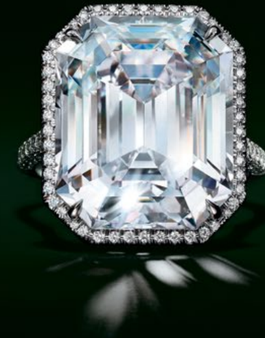
RING IN PLATINUM WITH AN INTERNALLY FLAWLESS, D COLOR, EMERALD-CUT DIAMOND OF OVER 15 CARATS AND ROUND BRILLIANT DIAMONDS.