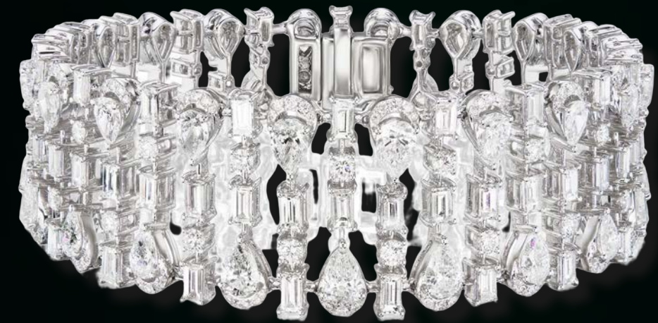
BROOCH IN PLATINUM WITH AN OVAL BLUE CUPRIAN ELBAITE TOURMALINE, TOURMALINES, FANCY, BLUE, PURPLE AND MONTANA SAPPHIRES WITH ROUND BRILLIANT DIAMONDS.