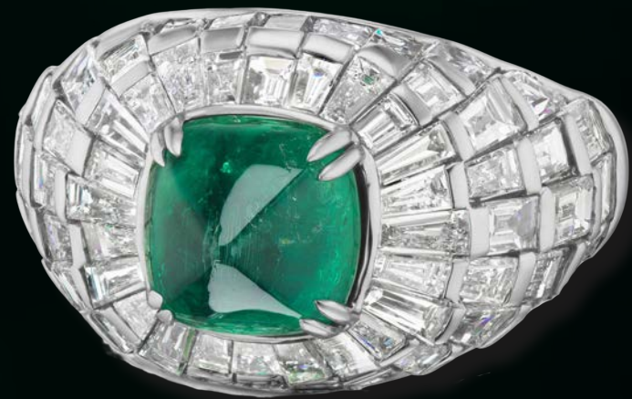
RING IN PLATINUM WITH AN ESTEEMED SRI LANKAN EMERALD-CUT SAPPHIRE OF OVER 24 CARATS AND ROUND BRILLIANT DIAMONDS.