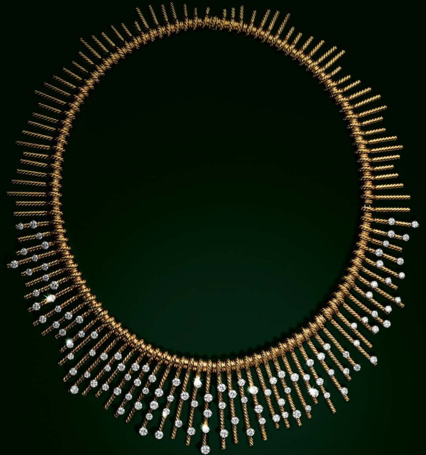
TIFFANY & CO. SCHLUMBERGER® NECKLACE IN 1 8 KYELLOW GOLD AND PLATINUM WITH ROUND BRILLIANT DIAMONDS.