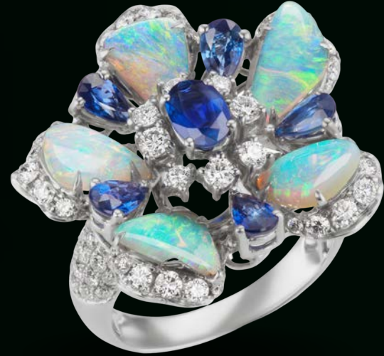
NECKLACE IN PLATINUM WITH BAGUETTE AND ROUND PINK SAPPHIRES AND ROUND BRILLIANT DIAMONDS.