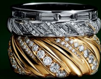
RING IN PLATINUM AND 18K YELLOW GOLD WITH BAGUETTE AND ROUND BRILLIANT DIAMONDS.