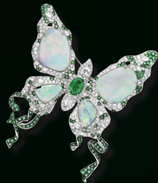
EARRINGS IN PLATINUM WITH ROUND PINK DIAMONDS AND ROUND BRILLIANT WHITE DIAMONDS.