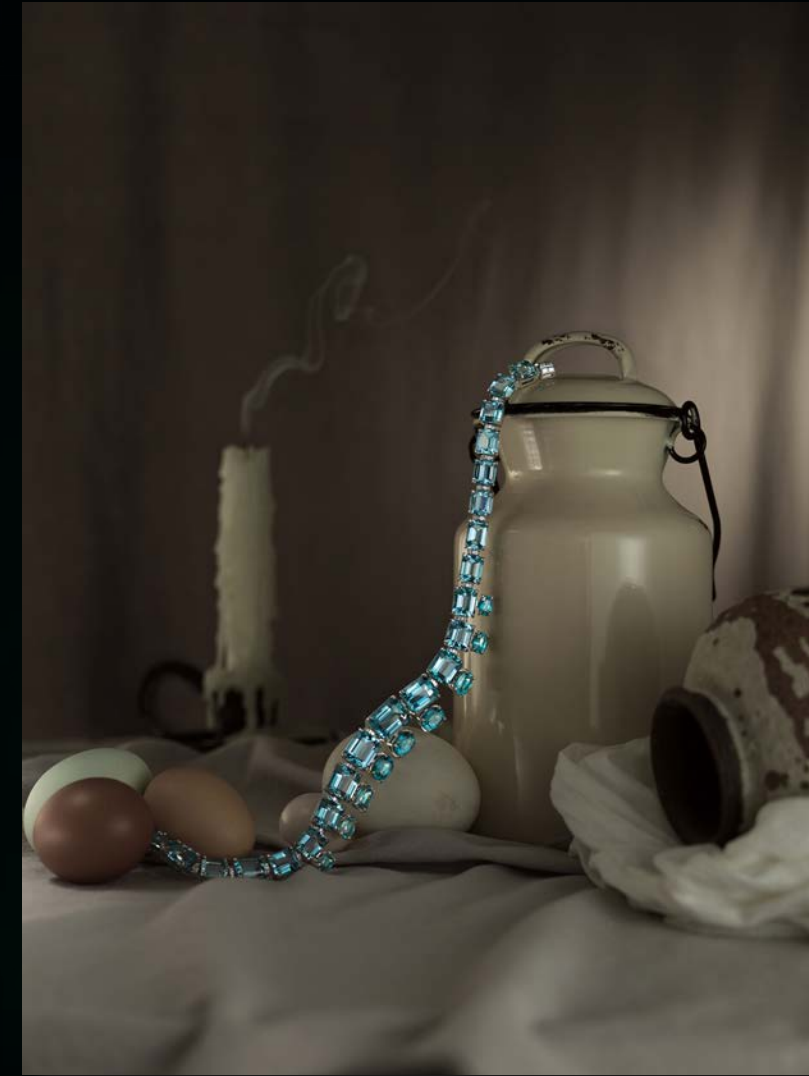
BROOCH IN PLATINUM WITH AN OVAL BLUE CUPRIAN ELBAITE TOURMALINE, TOURMALINES, FANCY, BLUE, PURPLE AND MONTANA SAPPHIRES WITH ROUND BRILLIANT DIAMONDS.