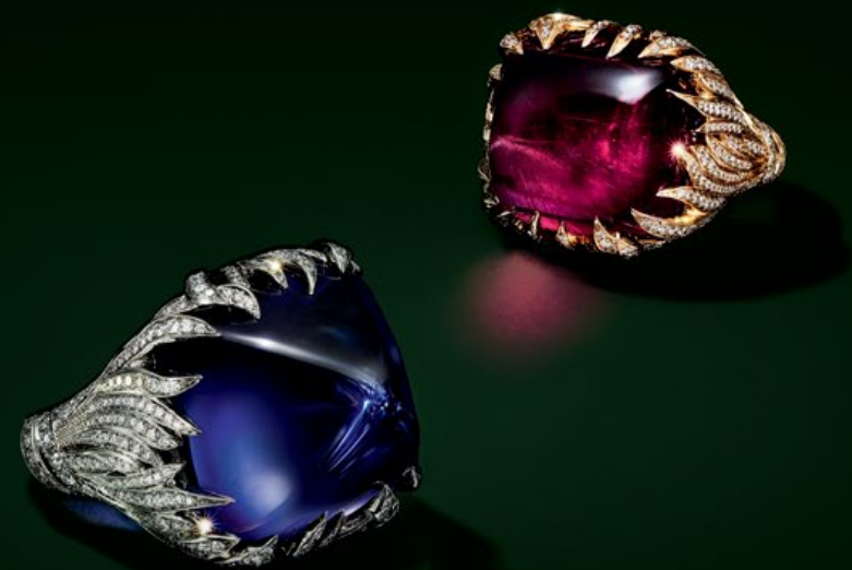
RING IN PLATINUM WITH A CABOCHON TANZANITE OF OVER 40 CARATS AND ROUND BRILLIANT DIAMONDS. RING IN 18K ROSE GOLD WITH A CABOCHON RUBELLITE OF OVER 25 CARATS AND ROUND BRILLIANT DIAMONDS.