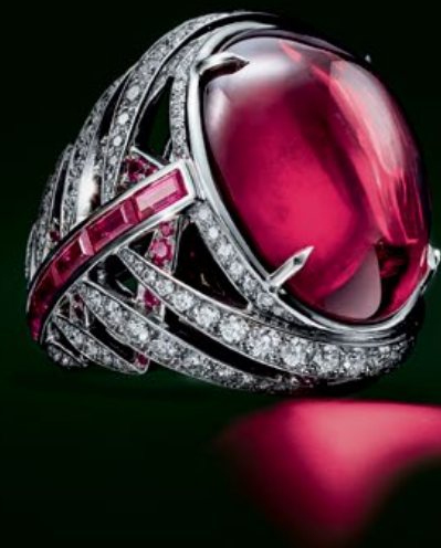
RING IN PLATINUM WITH A CABOCHON RUBELLITE OF OVER 22 CARATS, BAGUETTE AND ROUND PINK SAPPHIRES AND ROUND BRILLIANT DIAMONDS.