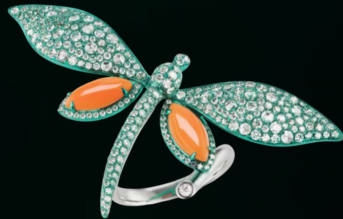
RING IN PLATINUM WITH AN ESTEEMED SRI LANKAN EMERALD-CUT SAPPHIRE OF OVER 24 CARATS AND ROUND BRILLIANT DIAMONDS.