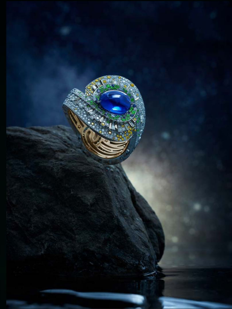
BROOCH IN PLATINUM WITH AN OVAL BLUE CUPRIAN ELBAITE TOURMALINE, TOURMALINES, FANCY, BLUE, PURPLE AND MONTANA SAPPHIRES WITH ROUND BRILLIANT DIAMONDS.