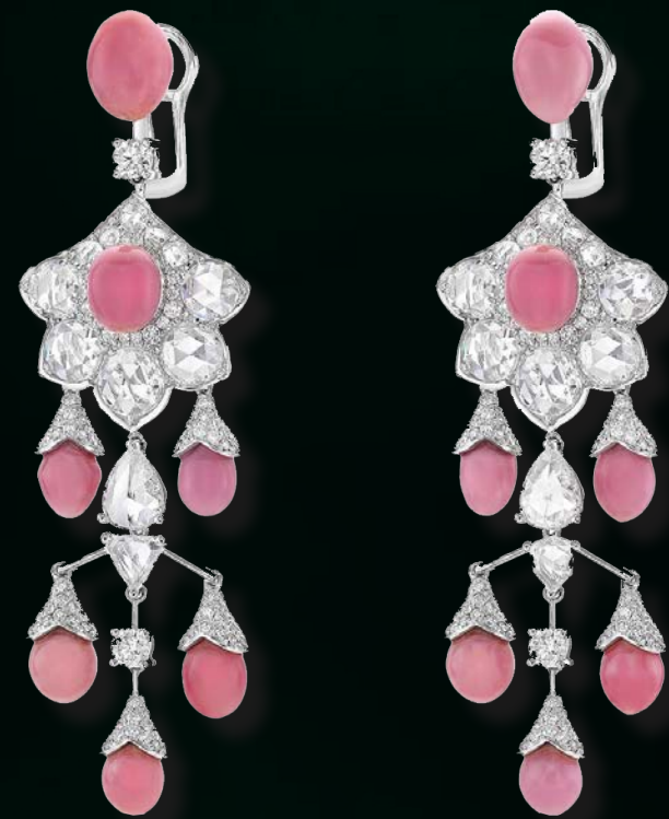
EARRINGS IN PLATINUM AND 18K YELLOW GOLD WITH PEAR-SHAPED SPESSARTITES OF OVER 8 TOTAL CARATS, ROUND YELLOW AND ROUND BRILLIANT WHITE DIAMONDS.