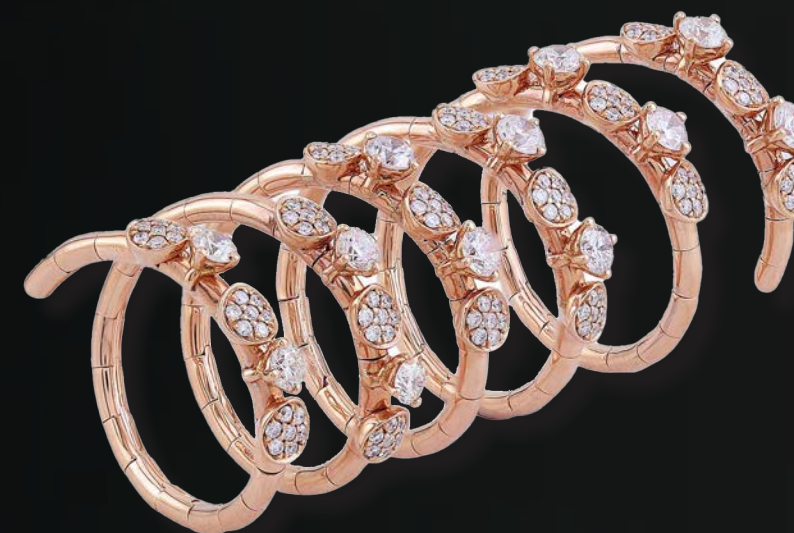
RING IN PLATINUM WITH AN UNENHANCED, ESTEEMED SRI LANKAN SAPPHIRE OF OVER 51 CARATS AND ROUND BRILLIANT DIAMONDS.