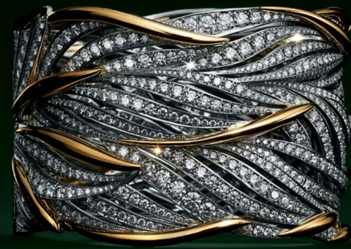
BRACELET IN PLATINUM AND 18 K YELLOW GOLD WITH ROUND BRILLIANT DIAMONDS.