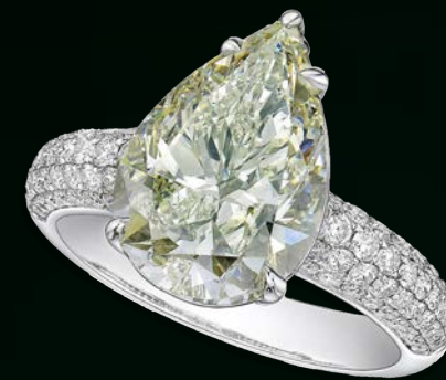
RING IN PLATINUM WITH AN OVAL BLUE CUPRIAN ELBAITE TOURMALINE OF OVER 13 CARATS, ROUND FANCY SAPPHIRES AND ROUND BRILLIANT DIAMONDS.