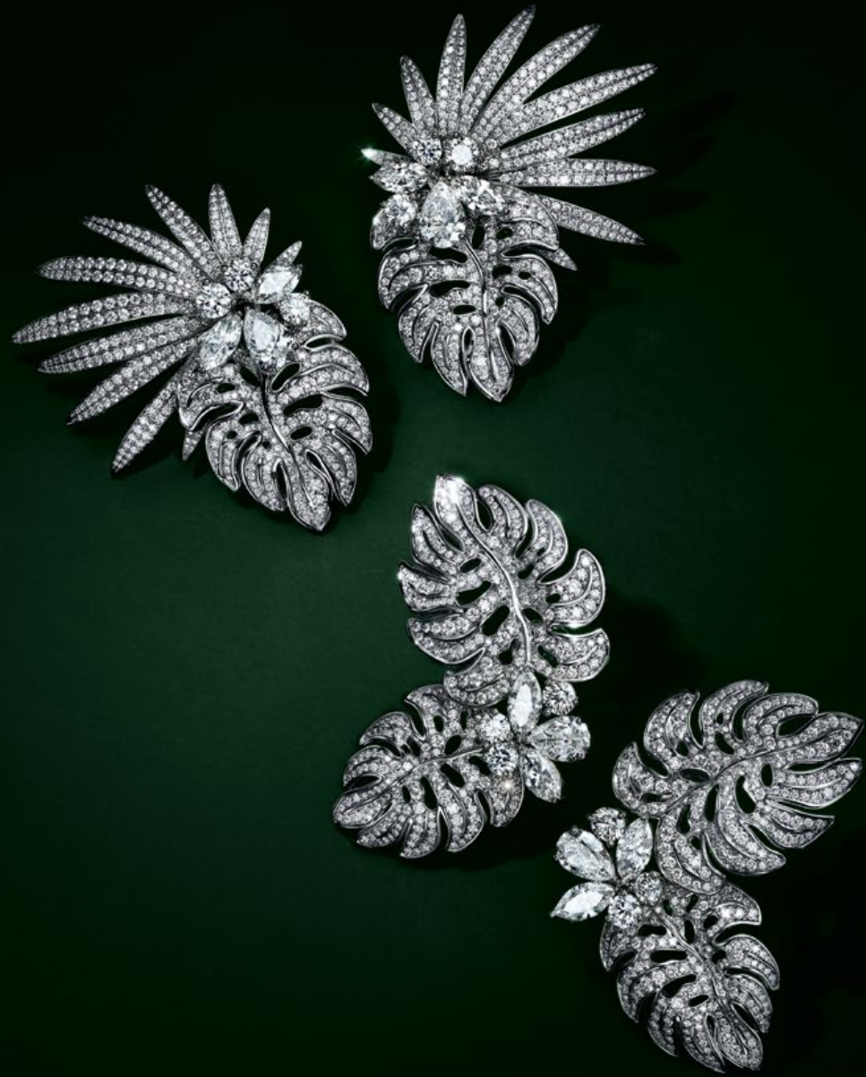
EARRINGS IN PLATINUM WITH ROUND PINK DIAMONDS AND ROUND BRILLIANT WHITE DIAMONDS.