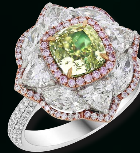
BROOCH IN PLATINUM WITH AN OVAL BLUE CUPRIAN ELBAITE TOURMALINE, TOURMALINES, FANCY, BLUE, PURPLE AND MONTANA SAPPHIRES WITH ROUND BRILLIANT DIAMONDS.