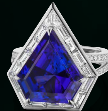
PENDANT IN PLATINUM WITH TWO MELO PEARLS OF OVER 100 TOTAL CARATS, BAGUETTE AND ROUND BRILLIANT DIAMONDS.