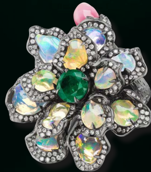
RING IN PLATINUM WITH AN ESTEEMED SRI LANKAN EMERALD-CUT SAPPHIRE OF OVER 24 CARATS AND ROUND BRILLIANT DIAMONDS.