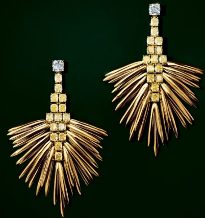
EARRINGS IN 18K YELLOW GOLD WITH CUSHION-CUT YELLOW AND WHITE DIAMONDS.