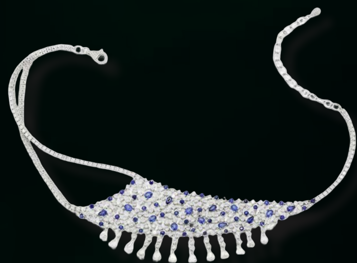
RING IN PLATINUM WITH AN ESTEEMED SRI LANKAN EMERALD-CUT SAPPHIRE OF OVER 24 CARATS AND ROUND BRILLIANT DIAMONDS.