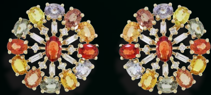
R I N G I N 1 8 KYELLOW GOLD WITH A CABOCHON GREEN TOURMALINE OF OVER 35 CARATS, ROUND TSAVORITES AND ROUND BRILLIANT DIAMONDS.