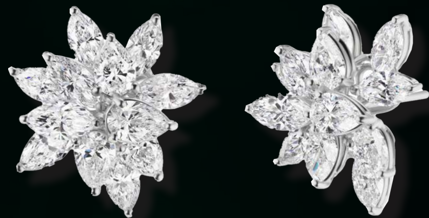
EARRINGS IN PLATINUM WITH MARQUISE AND ROUND BRILLIANT DIAMONDS.