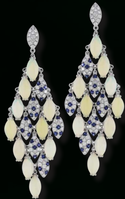
RING IN 18 K YELLOW GOLD WITH A CUSHION-CUT ORANGE SAPPHIRE OF OVER 11 CARATS AND ROUND BRILLIANT DIAMONDS.