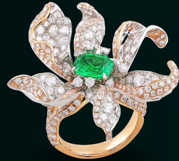
BRACELET IN PLATINUM WITH BAGUETTE AND ROUND PINK SAPPHIRES AND ROUND BRILLIANT DIAMONDS.