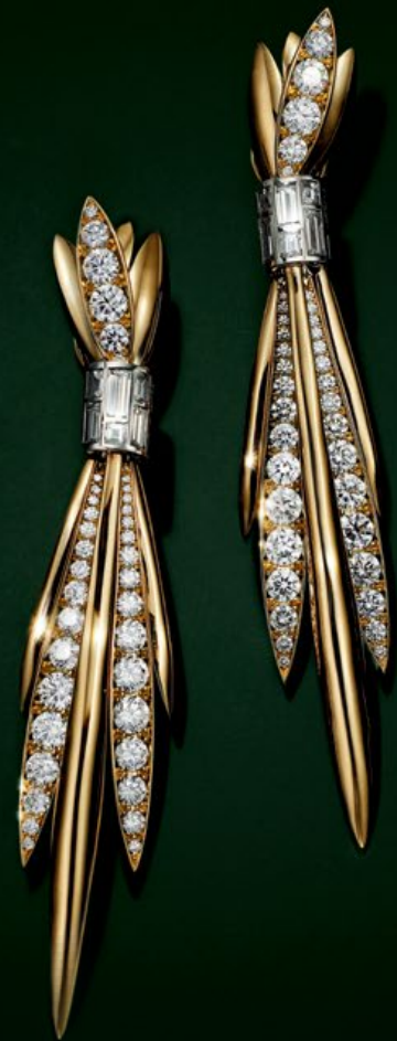
EARRINGS IN PLATINUM AND 18K YELLOW GOLD WITH BAGUETTE AND ROUND BRILLIANT DIAMONDS.