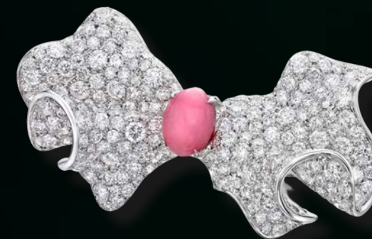
BROOCH IN PLATINUM WITH AN OVAL BLUE CUPRIAN ELBAITE TOURMALINE, TOURMALINES, FANCY, BLUE, PURPLE AND MONTANA SAPPHIRES WITH ROUND BRILLIANT DIAMONDS.