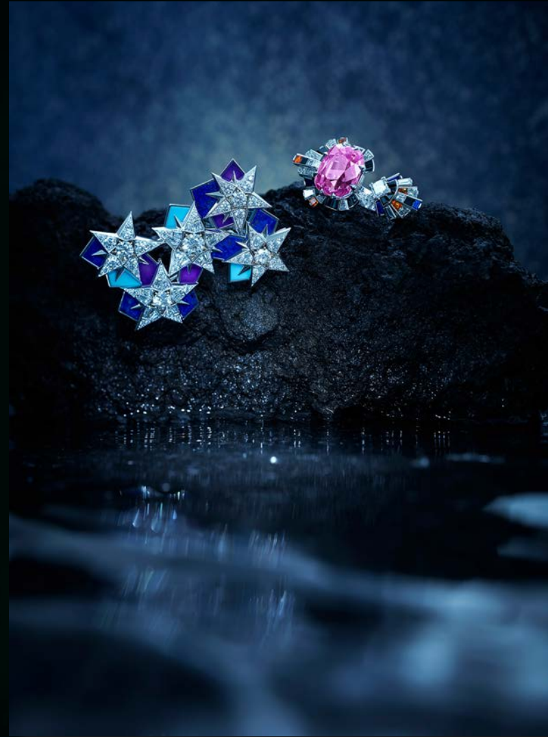
RING IN PLATINUM WITH AN ESTEEMED SRI LANKAN EMERALD-CUT SAPPHIRE OF OVER 24 CARATS AND ROUND BRILLIANT DIAMONDS.