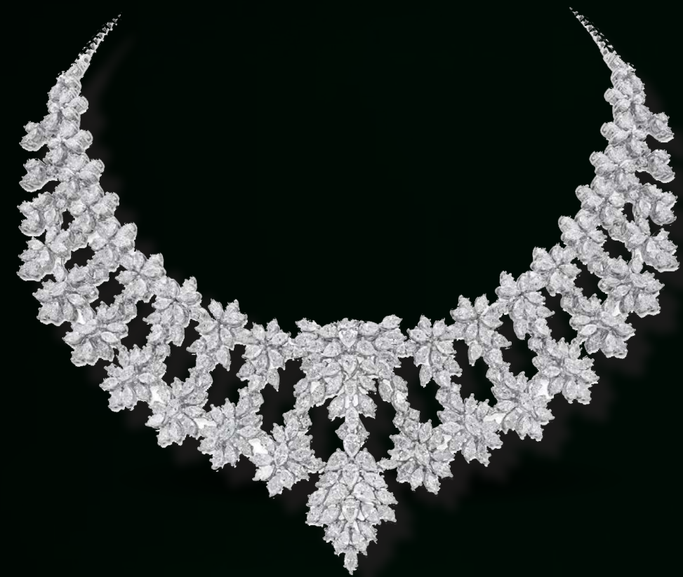
NECKLACE IN PLATINUM WITH SQUARE, BAGUETTE AND ROUND BRILLIANT DIAMONDS.