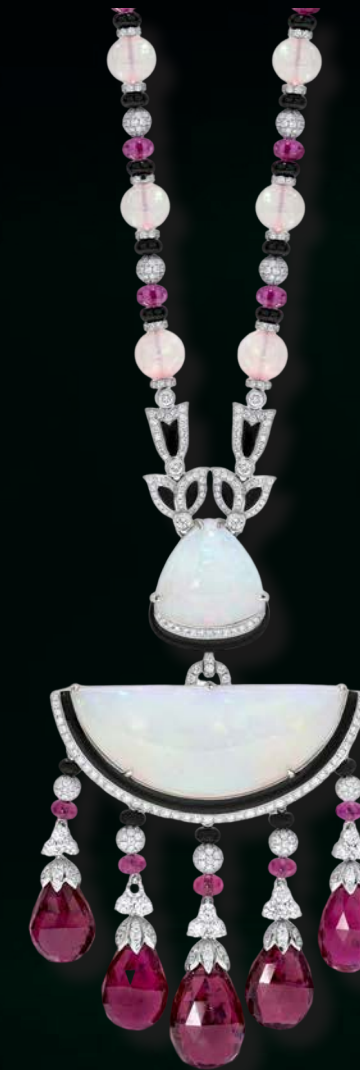
BROOCH IN PLATINUM WITH AN OVAL BLUE CUPRIAN ELBAITE TOURMALINE, TOURMALINES, FANCY, BLUE, PURPLE AND MONTANA SAPPHIRES WITH ROUND BRILLIANT DIAMONDS.