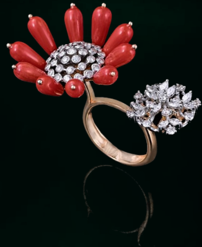
RING IN 18K YELLOW GOLD WITH AN OVAL SPESSARTITE OF OVER 26 CARATS AND ROUND BRILLIANT DIAMONDS.