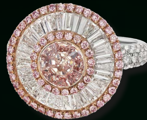
RING IN PLATINUM WITH A CABOCHON RUBELLITE OF OVER 52 CARATS AND ROUND BRILLIANT DIAMONDS.