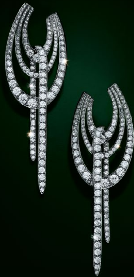
EARRINGS IN PLATINUM WITH ROUND BRILLIANT AND MIXED-CUT DIAMONDS.