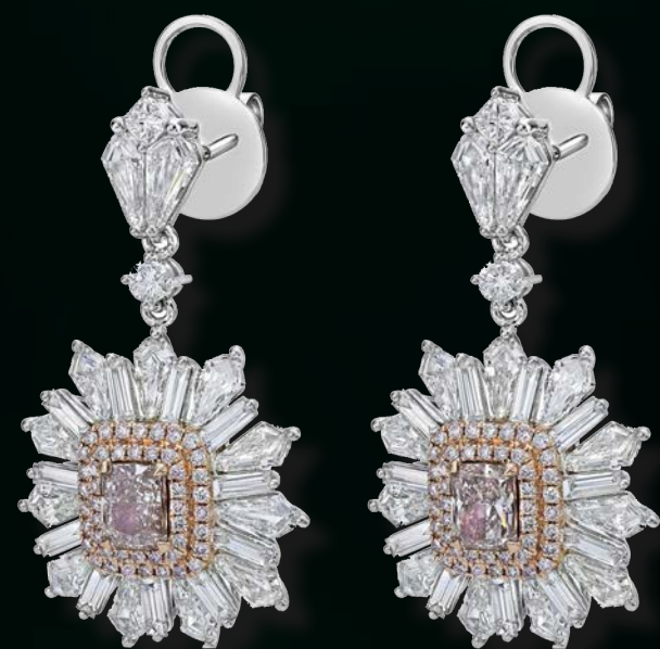
EARRINGS IN 18KYELLOW GOLD WITH CUSHION-CUT SPESSARTITES OF OV E R 1 1 TOTAL CARATS, ROUND SAPPHIRES ANDYELLOW DIAMONDS WITH ROUND BRILLIANT AND MARQUISE WHITE DIAMONDS.