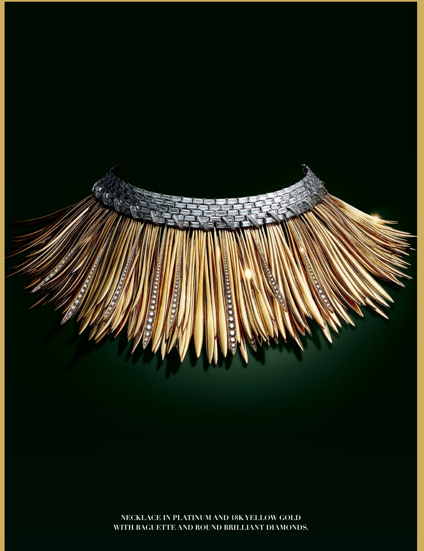
NECKLACE IN PLATINUM AND 18K YELLOW GOLD WITH BAGUETTE AND ROUND BRILLIANT DIAMONDS.