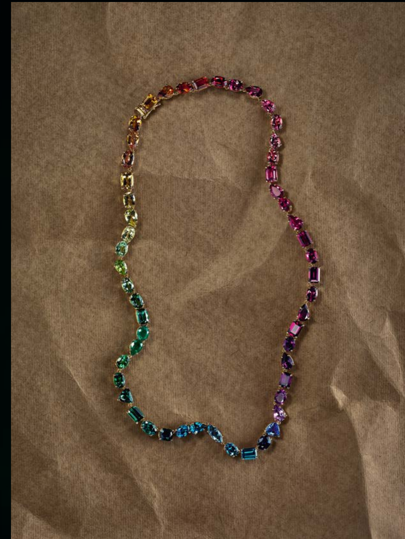
BROOCH IN PLATINUM WITH AN OVAL BLUE CUPRIAN ELBAITE TOURMALINE, TOURMALINES, FANCY, BLUE, PURPLE AND MONTANA SAPPHIRES WITH ROUND BRILLIANT DIAMONDS.