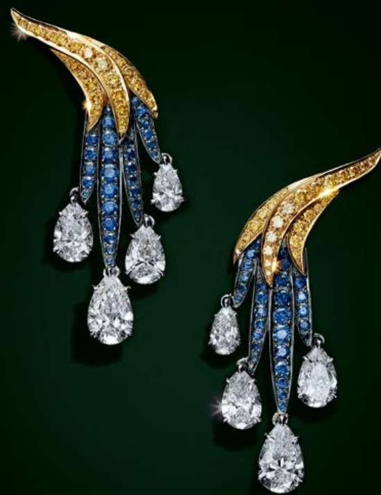
EARRINGS IN PLATINUM AND 18K YELLOW GOLD WITH PEAR-SHAPED WHITE DIAMONDS, ROUND SAPPHIRES AND ROUND YELLOW DIAMONDS.