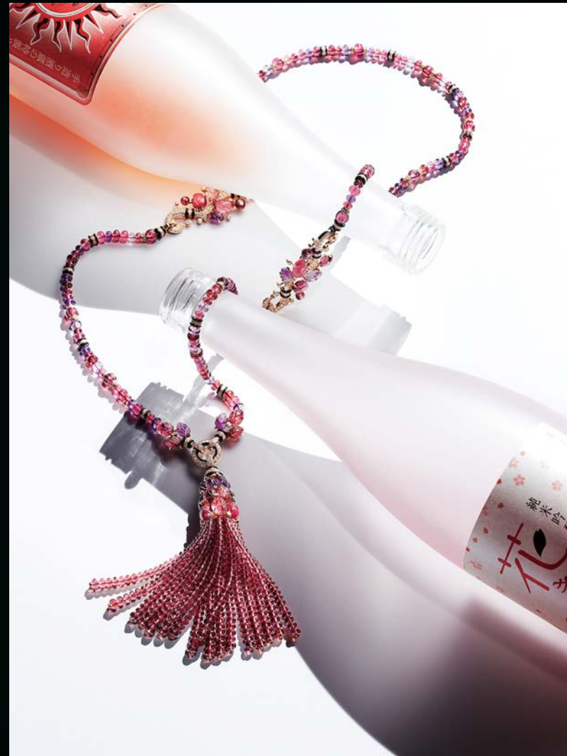
RING IN PLATINUM WITH AN ESTEEMED SRI LANKAN EMERALD-CUT SAPPHIRE OF OVER 24 CARATS AND ROUND BRILLIANT DIAMONDS.