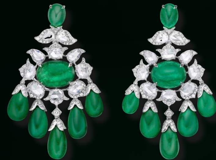
RING IN PLATINUM WITH AN UNENHANCED CUSHION-CUT PURPLE SAPPHIRE OF OVER 14 CARATS, HALF-MOON EMERALDS, ROUND PINK DIAMONDS AND ROUND BRILLIANT WHITE DIAMONDS.