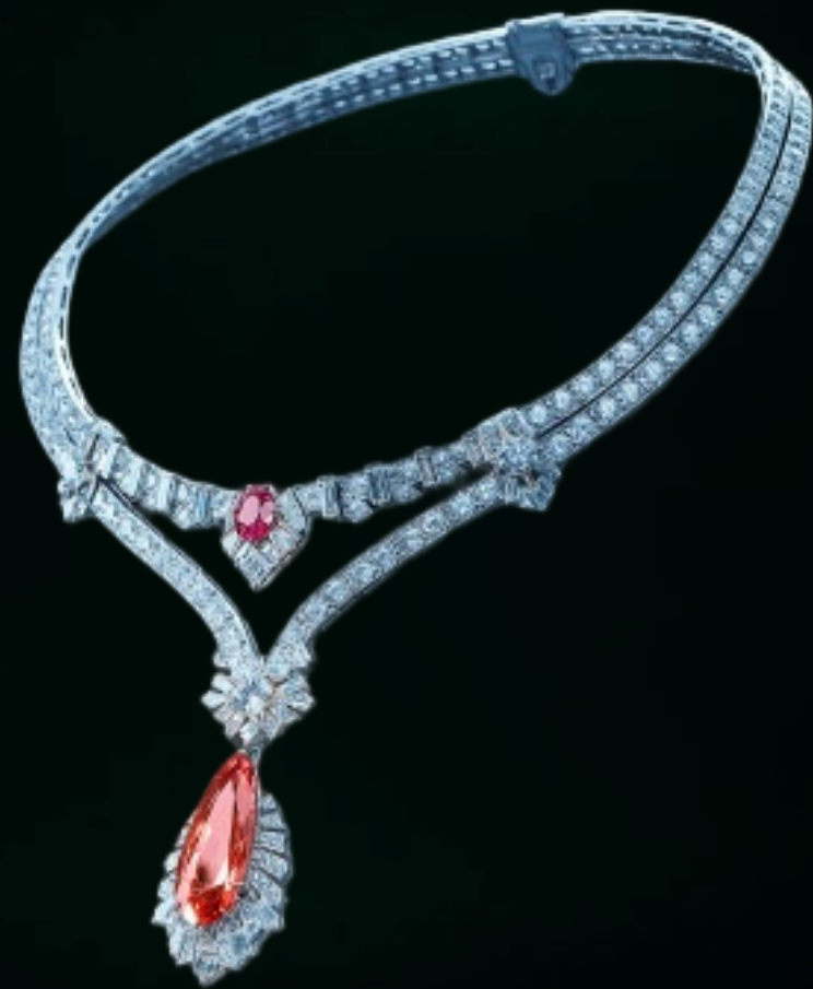
RING IN PLATINUM WITH AN ESTEEMED SRI LANKAN EMERALD-CUT SAPPHIRE OF OVER 24 CARATS AND ROUND BRILLIANT DIAMONDS.