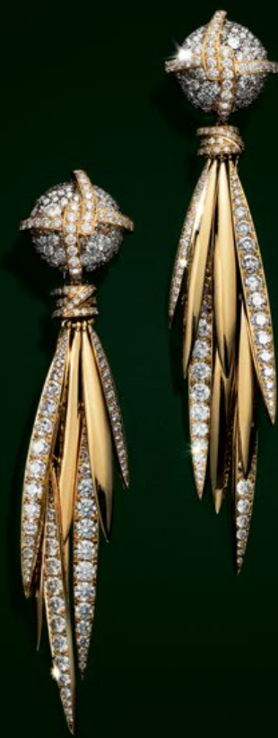
EARRINGS IN PLATINUM AND 18 KYELLOW GOLD WITH ROUND BRILLIANT DIAMONDS.