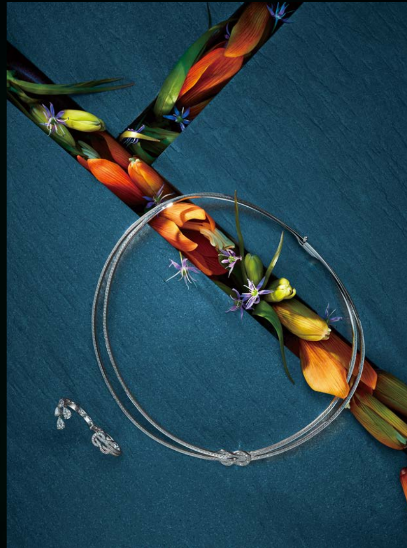
RING IN PLATINUM WITH AN ESTEEMED SRI LANKAN EMERALD-CUT SAPPHIRE OF OVER 24 CARATS AND ROUND BRILLIANT DIAMONDS.