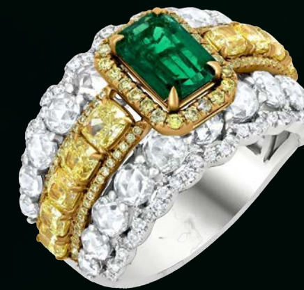
BROOCH IN PLATINUM WITH AN OVAL BLUE CUPRIAN ELBAITE TOURMALINE, TOURMALINES, FANCY, BLUE, PURPLE AND MONTANA SAPPHIRES WITH ROUND BRILLIANT DIAMONDS.