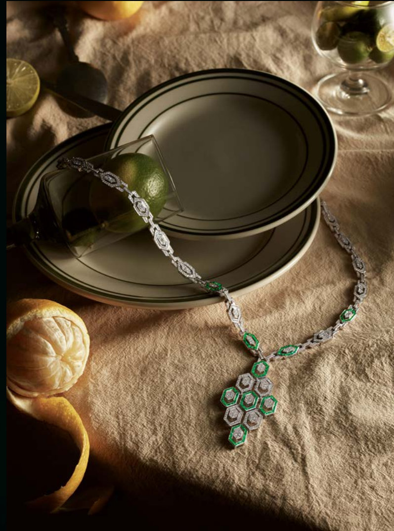
RING IN PLATINUM WITH AN ESTEEMED SRI LANKAN EMERALD-CUT SAPPHIRE OF OVER 24 CARATS AND ROUND BRILLIANT DIAMONDS.