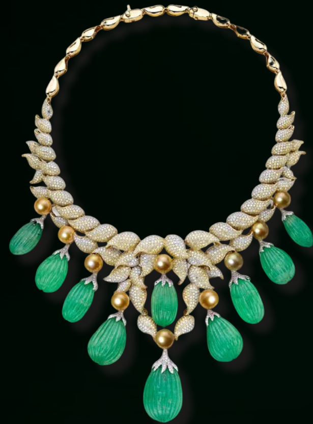
EARRINGS IN PLATINUM WITH CUSHION-CUT RUBELLITES, OVER 16 TOTAL CARATS, AND BAGUETTE AND ROUND PINK SAPPHIRES.