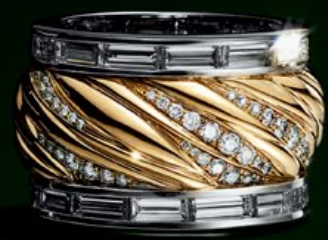
RING IN PLATINUM AND 18K YELLOW GOLD WITH BAGUETTE AND ROUND BRILLIANT DIAMONDS.