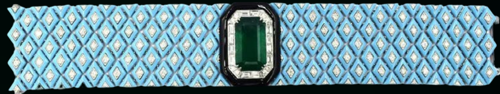
RING IN PLATINUM WITH AN ESTEEMED SRI LANKAN EMERALD-CUT SAPPHIRE OF OVER 24 CARATS AND ROUND BRILLIANT DIAMONDS.