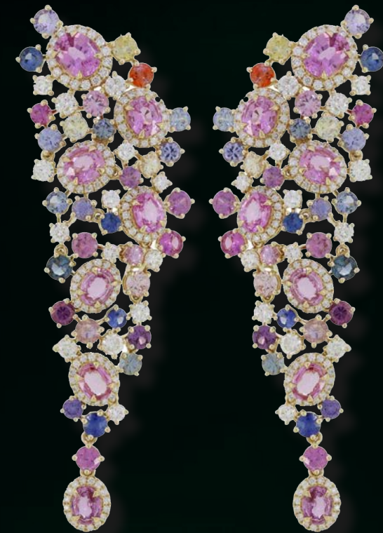
RING IN PLATINUM WITH AN OVAL ORANGE SAPPHIRE OF OVER 10 CARATS AND ROUND BRILLIANT DIAMONDS.