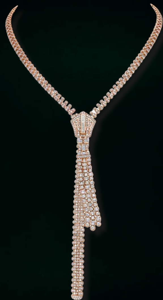
RING IN PLATINUM WITH AN ESTEEMED SRI LANKAN EMERALD-CUT SAPPHIRE OF OVER 24 CARATS AND ROUND BRILLIANT DIAMONDS.