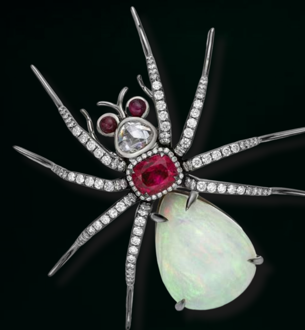
BROOCH IN PLATINUM WITH AN OVAL BLUE CUPRIAN ELBAITE TOURMALINE, TOURMALINES, FANCY, BLUE, PURPLE AND MONTANA SAPPHIRES WITH ROUND BRILLIANT DIAMONDS.