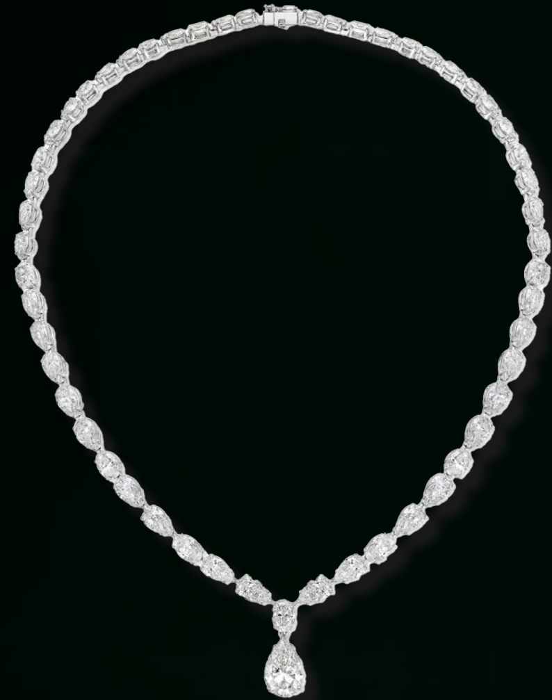
BRACELET IN PLATINUM WITH BAGUETTE AND ROUND BRILLIANT DIAMONDS.