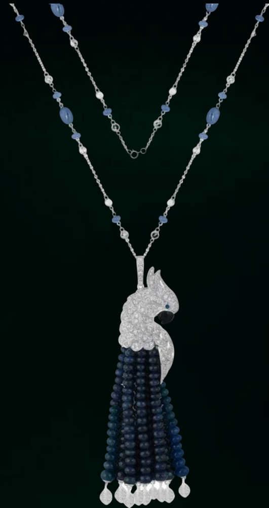
RING IN PLATINUM WITH AN ESTEEMED SRI LANKAN EMERALD-CUT SAPPHIRE OF OVER 24 CARATS AND ROUND BRILLIANT DIAMONDS.