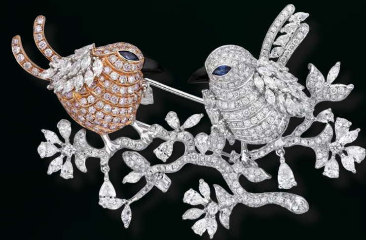
BROOCH IN PLATINUM WITH AN OVAL BLUE CUPRIAN ELBAITE TOURMALINE, TOURMALINES, FANCY, BLUE, PURPLE AND MONTANA SAPPHIRES WITH ROUND BRILLIANT DIAMONDS.