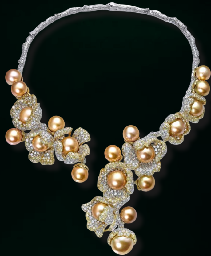
RING IN PLATINUM WITH AN ESTEEMED SRI LANKAN EMERALD-CUT SAPPHIRE OF OVER 24 CARATS AND ROUND BRILLIANT DIAMONDS.