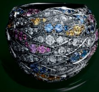
RING IN PLATINUM WITH ROUND FANCY SAPPHIRES AND ROUND BRILLIANT DIAMONDS.