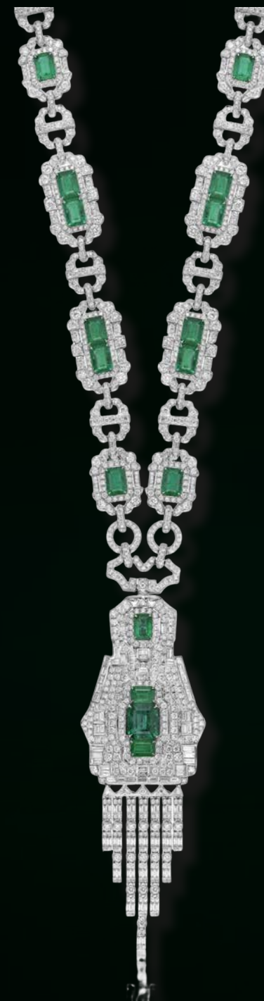
RING IN PLATINUM WITH AN UNENHANCED EMERALD-CUT PINK SAPPHIRE OF OVER 6 CARATS, ROUND PINK DIAMONDS AND ROUND BRILLIANT WHITE DIAMONDS.