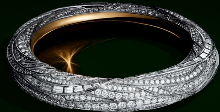
BRACELET IN PLATINUM AND 18K YELLOW GOLD WITH BAGUETTE AND ROUND BRILLIANT DIAMONDS.