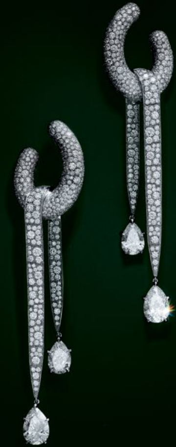
EARRINGS IN PLATINUM WITH PEAR-SHAPED AND ROUND BRILLIANT DIAMONDS.