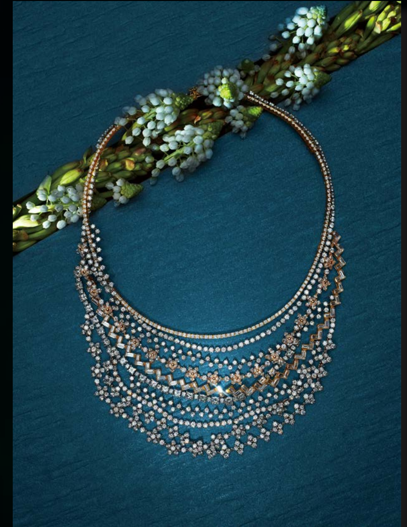
BROOCH IN PLATINUM WITH AN OVAL BLUE CUPRIAN ELBAITE TOURMALINE, TOURMALINES, FANCY, BLUE, PURPLE AND MONTANA SAPPHIRES WITH ROUND BRILLIANT DIAMONDS.