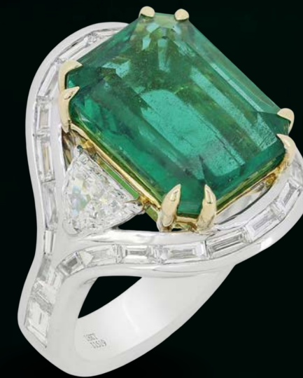
RING IN PLATINUM WITH A PAIR OF OVAL AMETHYSTS OF OVER 2.7 TOTAL CARATS AND ROUND BRILLIANT DIAMONDS. RING IN PLATINUM WITH A PAIR OF OVAL AQUAMARINES OF OVER 2.3 TOTAL CARATS AND ROUND BRILLIANT DIAMONDS.