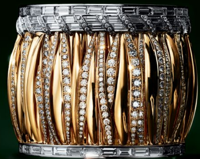
BRACELET IN PLATINUM AND 18K YELLOW GOLD WITH BAGUETTE AND ROUND BRILLIANT DIAMONDS.