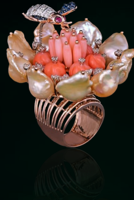
RING IN 18K ROSE GOLD WITH A CABOCHON RUBELLITE OF OVER 22 CARATS AND ROUND BRILLIANT DIAMONDS. RING IN PLATINUM WITH A CABOCHON BLUE TOURMALINE OF OVER 22 CARATS AND ROUND BRILLIANT DIAMONDS.