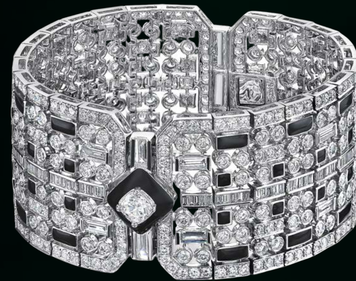
BROOCH IN PLATINUM WITH AN OVAL BLUE CUPRIAN ELBAITE TOURMALINE, TOURMALINES, FANCY, BLUE, PURPLE AND MONTANA SAPPHIRES WITH ROUND BRILLIANT DIAMONDS.