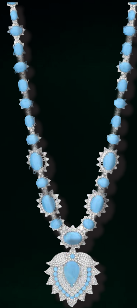
RING IN PLATINUM WITH AN ESTEEMED CUSHION-CUT EMERALD OF OVER 8 CARATS AND ROUND BRILLIANT DIAMONDS.